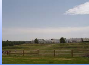
Idalia Court Revolving Loan Fund Cleanup, Aurora, CO