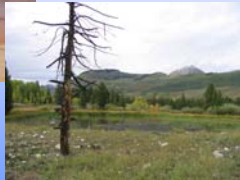
Peanut Mine Mine scarred land cleanup Crested Butte, Colorado